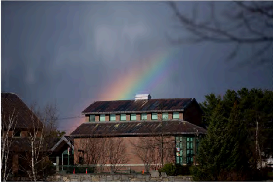
Bates College Museum of Art, Lewiston, Maine

That the essential individual and collective work many in our field are doing is recognized and supported by the institutions we work in. So many in the field do amazing work that is indispensable to our campus and regional communities. We are often campus leaders developing culturally diverse programs and collections, creating topical exhibitions and projects that address compelling and difficult subjects relevant to now, leading on addressing DEAI at our institutions, whose institutions are centers of interdisciplinary education—don't get me started!