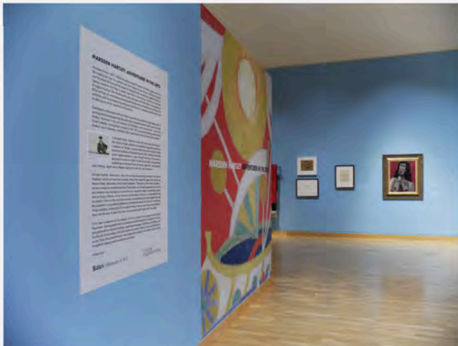
Marsden Hartley: Adventurer in the Arts , September 20 – November 19, 2021