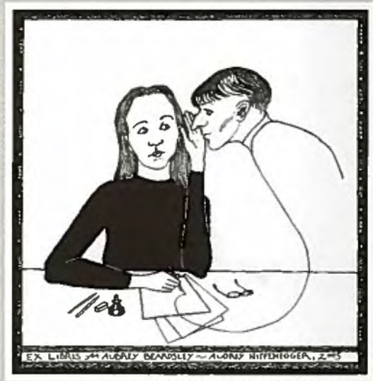
AUDREY NIFFENEGGER Aubrey Beardsley