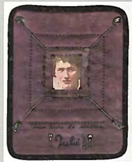
PATRICIA NIFFENEGGER Julia Child