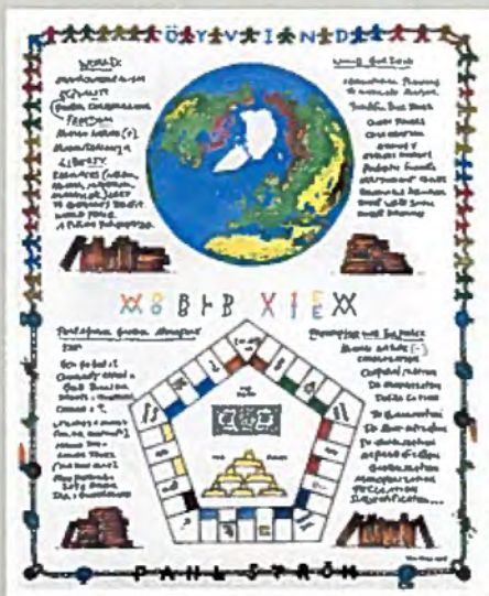
DAN MILLS Öyvind Fahlström