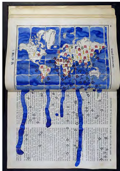
AIRS by Continent (Asylum, IDP, Refugees, Stateless) Book 14, 2017, ink and watercolor on atlas, 16 1/2 x 11 x 2 inches

Not all are from wars and conflicts: 19,000,000 are displaced due to natural disasters (although fragile populations in areas with ongoing conflicts are often part of this figure).