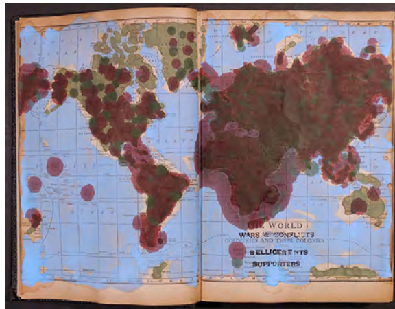
Wars and Conflicts by Continent, Belligerents and Supporters Book 04, 2017, ink and watercolor on atlas, 7 3/4 x 11 1/2 x 3/4 inches

Cumulatively, how many belligerent groups (those directly involved in war) are there, and how many supporters (groups providing assistance to belligerents but not actively fighting) are there?