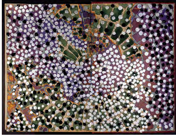
Wars and Conflicts by Continent, Belligerents and Supporters Book 09, 2017, ink, watercolor, and lacquer on atlas, 10 1/2 x 14 x 1 inches

Due to political upheaval here and abroad, we are entering an era in which all of these numbers could continue to increase exponentially.