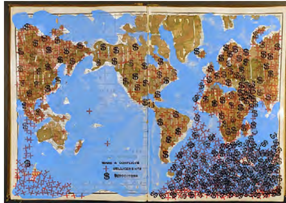
Wars and Conflicts by Continent, Belligerents and Supporters Book 06, 2017, ink, watercolor, and gouache on atlas, 10 1/2 x 15 1/2 x 1 inches

Cumulatively, how many belligerent groups (those directly involved in war) are there, and how many supporters (groups providing assistance to belligerents but not actively fighting) are there?