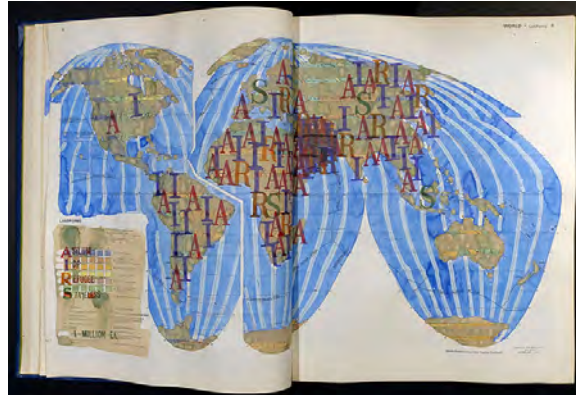
AIRS by Continent (Asylum, IDP, Refugees, Stateless) Book 17, 2017, ink, watercolor, and gouache on atlas, 11 1/2 x 17 3/4 x 2 1/2 inches

The number of people displaced by wars and conflicts rose from 37,500,000 in 2004 to 59,500,000 in 2014.