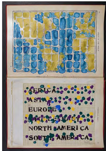
AIRS by Continent (Asylum, IDP, Refugees, Stateless) Book 05, 2017, ink, watercolor, lacquer, and collage on atlas, 12 x 8 1/8 x 1 inches

The number of people displaced by wars and conflicts rose from 37,500,000 in 2004 to 59,500,000 in 2014.