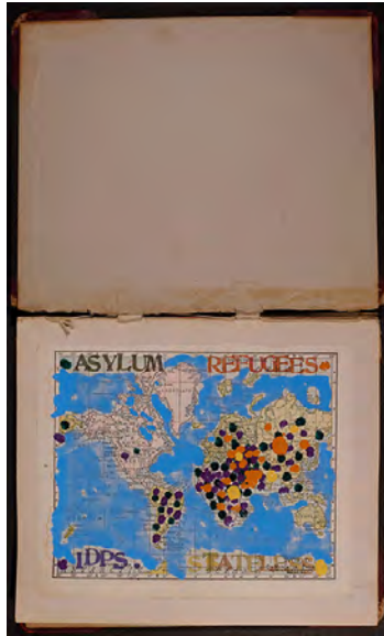
AIRS by Continent (Asylum, IDP, Refugees, Stateless) Book 06, 2017, ink, watercolor, and lacquer on map collaged to notebook, 14 1/4 x 8 1/2 x 3/4 inches