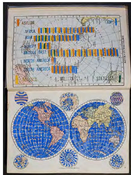
AIRS by Continent (Asylum, IDP, Refugees, Stateless) Book 07, 2017, ink, watercolor, and lacquer on atlas, 10 1/8 x 7 1/2 x 1 inches

In addition to death, what are the effects of these ongoing wars and conflicts on populations? Many people become Refugees, Internally Displaced, Asylum Seekers, or Stateless.