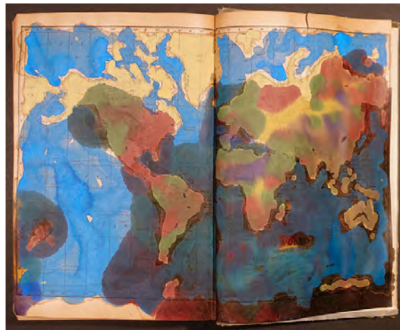
AIRS by Continent (Asylum, IDP, Refugees, Stateless) Book 15, 2017, ink, watercolor, and gouache on atlas, 8 1/4 x 10 1/2 x 1 1/2 inches

How do these figures compare to years past? Let's look at the category, Internally Displaced People.