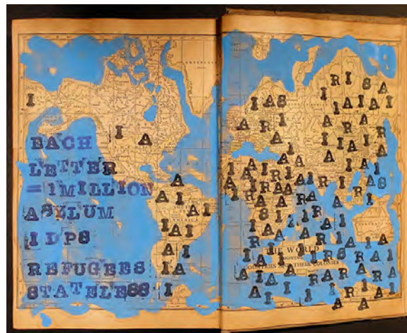
AIRS by Continent (Asylum, IDP, Refugees, Stateless) Book 09, 2017, ink, watercolor, gouache on atlas, 8 x 11 x 1 3/4 inches

In 2014, there were 47 ongoing wars and conflicts.