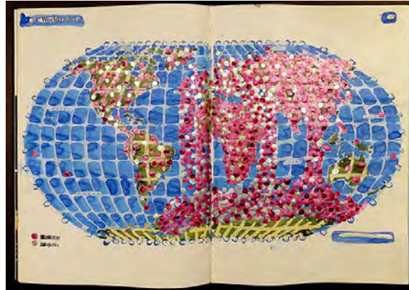
Wars and Conflicts by Continent, Belligerents and Supporters Book 07, 2017, ink, watercolor, and lacquer on atlas, 22 x 15 x 1 3/4 inches

In addition to death, what are the effects of these ongoing wars and conflicts on populations? Many people become Refugees, Internally Displaced, Asylum Seekers, or Stateless.