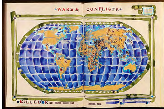
Wars and Conflicts Killed by Continent, Book 03, 2017, ink, watercolor, and gouache on atlas, 13 3/4 x 20 1/2 x 1 1/2 inches

13 had fewer than 100 deaths last year, yet are responsible for an estimated 795,000 cumulative deaths.