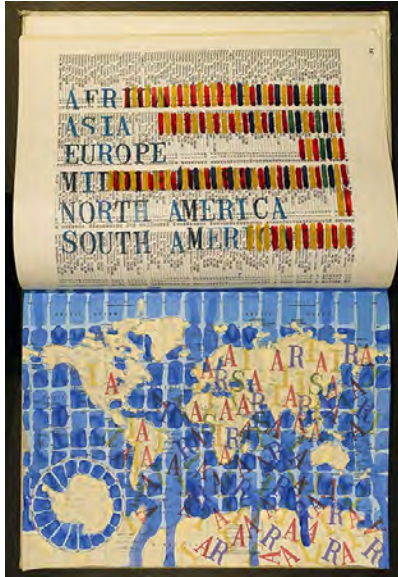
AIRS by Continent (Asylum, IDP, Refugees, Stateless) Book 12, 2017, ink, watercolor, gouache, and lacquer on atlas, 19 x 12 1/2 x 2 1/4 inches