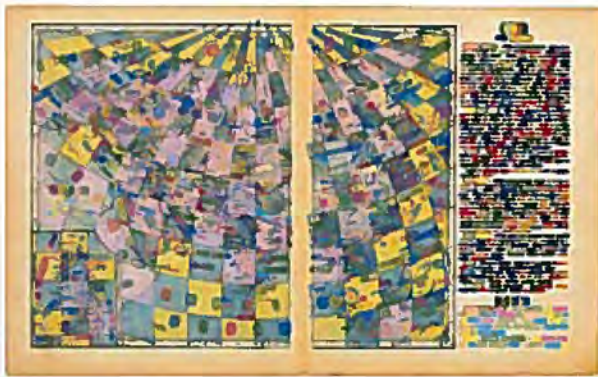
Dan Mills, Erosure (Cool) from the Quest series, 2012

In his cartographic interventions, Dan Mills employs humor, satire, and a critique of national and regional power dynamics through a reworking of images from the past. Specifically, he reconfigures world maps so as to allude to the artifice of all mapping systems, and, simultaneously, to highlight the imperial power and history embedded within them. Mills's recent projects, Quest (2012-ongoing) and U.S. Future States Atlas (2003-9), critique geographic boundaries and nationalist ambitions through maps of the U.S. and other parts of the world that emerged from a history of colonization since the American Revolution. He describes the projects as "a grand narrative atlas of global imperialism" and reminds the viewer of the arbitrary nature of national boundaries, considering their frequent origins in military aggression.