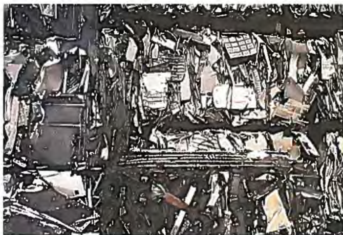
Kamau Amu Patton, Cyber Landscape , 2013, Courtesy the artist (video still)

Working at the intersection of electronics, objects and kinesthetic body awareness, Kamau Amu Patton focuses on questions of metaphysics, where iconic images are reframed by a subjective futurality. Abstract visual forms and associated, sometimes viewer activated, sound components link the body's use of material things to the mutability of nature within environments, thereby heightening the viewer's sense of time/space relationships. For Cyber Landscape (2013), Patton filmed piles of e-waste at a Fresno waste facility; the resulting visual patterns of the waste are reminiscent of abstract painting, and the soundtrack dings and crackles as if the now defunct products are screaming out from another world. Displayed on a 1990s-style LAN computer station, it is a reminder of the proliferation of these products, and their resulting environmental, health, and safety issues around the world.