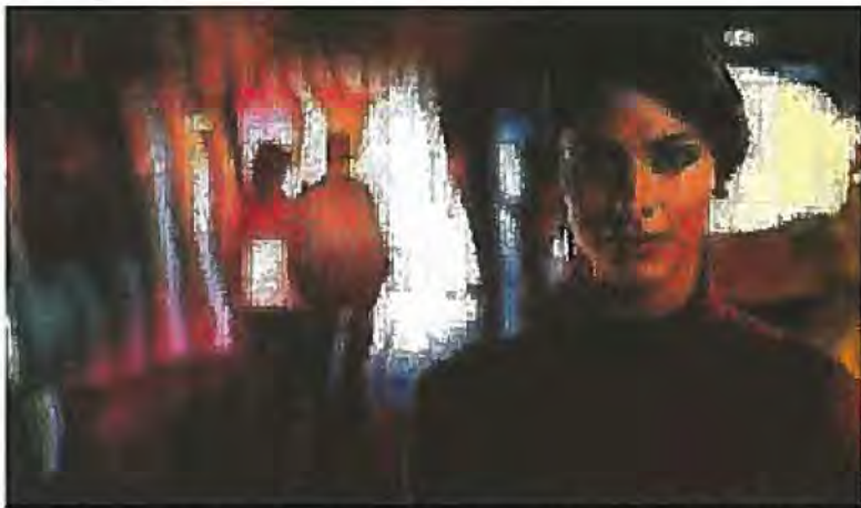
The Otolith Group, Anathema, 2011, (video still)