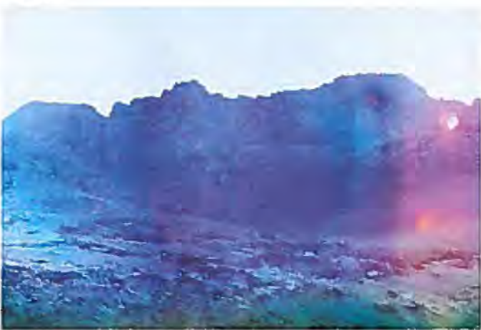
Basim Magdy, Investigating the Color Spectrum of a Post- Apocalyptic Future Landscape , 2013, Courtesy Marissa Newman Projects, New York and Art Dubai

Basim Magdy creates art that engenders a sense of the otherworldly, obscuring the usual demarcation between the real and the imaginary. Like science fiction, his dream worlds are grounded in tangible realities so that the absurd seems plausible and scenarios which seem farfetched become imaginable. This speaks to Magdy’s main objective, the conflation of reality and the fanciful to open up a discourse about what is possible through an examination of paradoxical relationships between future and historical eras and cycles of destruction and rebirth. Many of his works—for instance An Eavesdropper Lurks in the Shadow of Your Every Thought or The Only Memory I Have of my Past Life is the Uniformity of the Circumstances —are humorous or provocative, and serve as invitations to imagine a different reality, a dream world spun from science fiction and human potentialities.