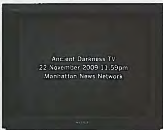
Katie Paterson, Ancient Darkness TV , 2010 (film still)

Working in sculpture, sound, and installation, Berlin-based artist Katie Paterson's practice examines the cosmos, often bringing the viewer closer to the vast, unthinkable depth of the universe's scale of space and time. By facilitating an encounter with the sublime limitlessness of the universe, Paterson's artworks remind us that there is a time, and distance, much greater than that produced and measured by humanity. Her explorations thus alternately ask the viewer to contemplate the enormous gulf separating the current moment from that of the origin of the universe; bridge gaps between humanity and the infinite darkness of the cosmos; underscore the variability and fluctuation of time; and remind us of the mutability of the past, present, and future.