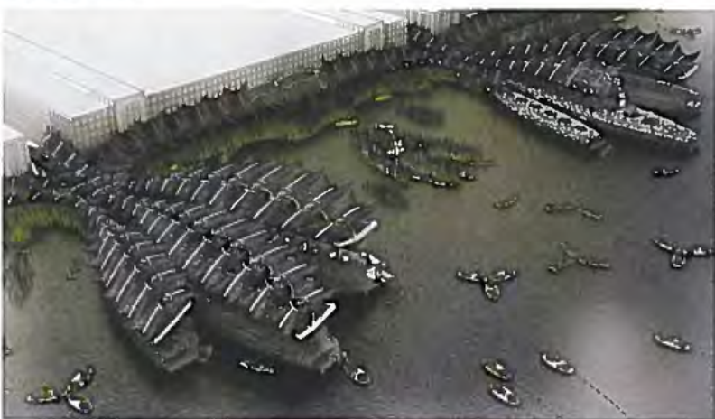
Future Cities Lab, HYDRAMAX , 2012, Courtesy the artists