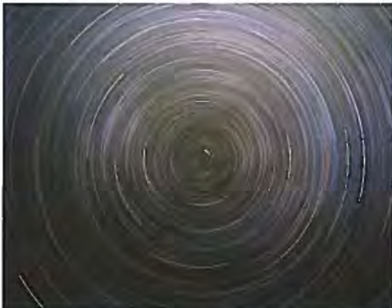
Trevor Paglen, Nine Recon- naissance Satellites over the Sonora Pass, 2008

The artist, writer, geographer, and photographer Trevor Paglen has earned international renown for creating work that deliberately blurs the lines between science, contemporary art, journalism, and other seemingly disparate disciplines. A deep fascination with deciphering and unearthing political secrets has motivated him over the past decade to take thousands of photographs of the U.S. government's most closely guarded secrets—the so-called "black world" of classified military activity. Although his process is reminiscent of investigative photojournalism, it results in compositions that provoke critical reflection on the validity of documentary photography as a means of recording the "truth." In fact, his works exist not as "truth," but as a visual metaphor for our existential disorientation at a time when major ideologies are collapsing.