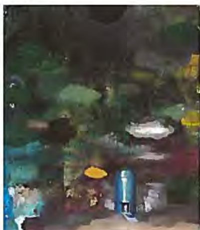
David Huffman, Black Hole , 2008, Courtesy the artist and Patricia Sweetow Gallery, San Francisco

David Huffman is an Afro-Futurist painter whose practice is inspired by astronomy, comics, Japanese anime, events such as Hurricane Katrina, and 1950s science fiction. Through an invented spacesuit-clad figure called a traumanaut, Huffman references the struggles of African Americans to establish their rightful cultural identity in social histories and representations—specifically the traumatic rupture of existence for African American slaves. By using Afro-Futurism as a starting point to build his visual narratives, Huffman draws from the past to reimagine what the future could look like for racial minorities in the United States based on historical moments of oppression. Ultimately, Huffman’s traumanaut reveals the journey of a figure that has endured significant pain, has learned from the past how to heal, and is forging a new identity for the future.