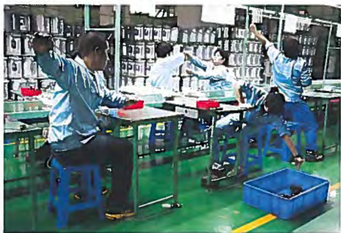
Revital Cohen and Tuur Van Balen, 75 Watt , 2013, Courtesy the artists (video still)

Revital Cohen and Tuur van Balen's collaborative, experimental, design practice produces objects, photographs, performances, and videos that explore the political, ethical, and aesthetic implications of technology. Through their work, Cohen and van Balen attempt to reexamine the relationships between human and animal, body and machine, machine and technology. In 75 Watt (2013), the artists collaborated with workers in a factory in Zhongshan, China, where the workers' end product is a choreographed dance generated by an object's assembly. By shifting the purpose of the worker's actions from the efficient production of objects to the performance of choreographed acts, 75 Watt reinterprets mechanical movement as one of the most human forms of motion: dance. As such, 75 Watt stands as a symbolic commemoration of the end of one era and the looming of an inevitable, yet still unknown, future.