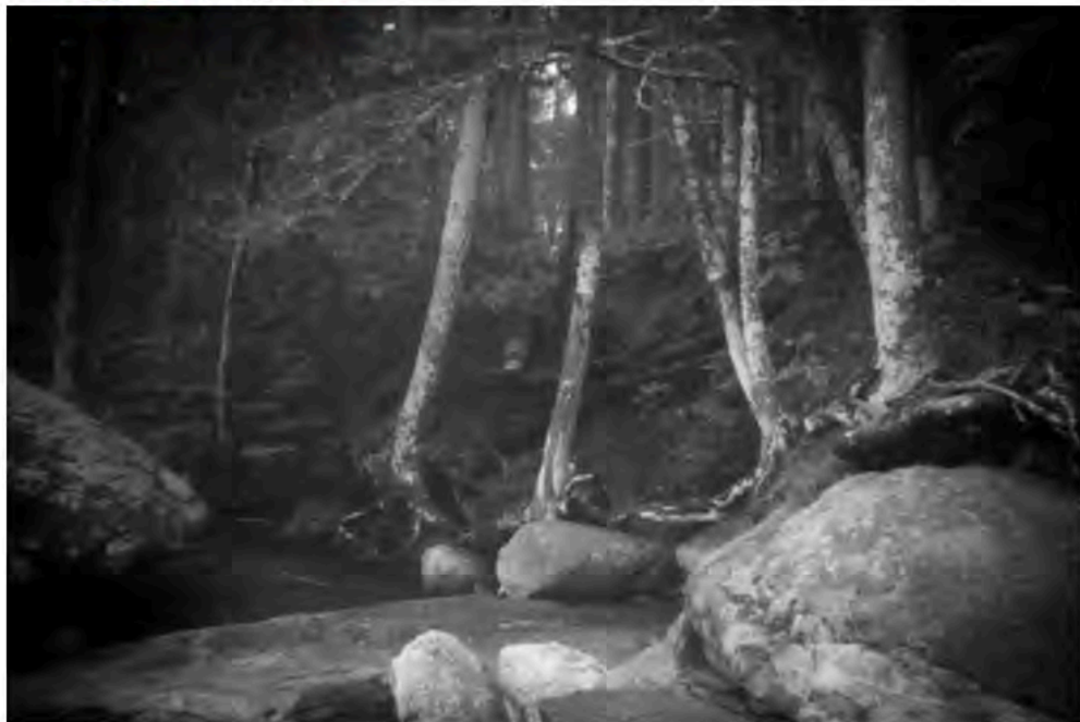
Untitled, by Elizabeth Greenberg, 2016, pigment print, 30 by 40 inches.

In 1961, Piero Manzoni created a notorious work of art, in which he labeled 90 tin cans as though each was filled with 30 grams of an artist's feces.