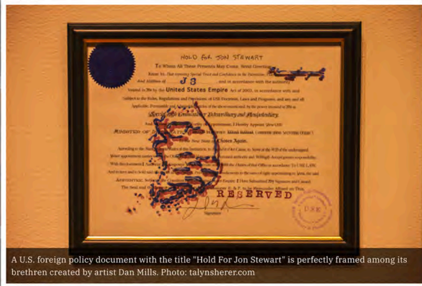
A U.S. foreign policy document with the title "Hold For Jon Stewart" is perfectly framed among its brethren created by artist Dan Mills.