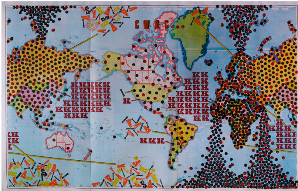
Dan Mills, Current Wars & Conflicts... (with, by continent, belligerent and supporter groups marked in black and red circles, Asylum Seekers, Internally Displaced, Refugees, and Stateless marked with a letter for every million, and killed marked with letters for every 250k), 2017, ink on digitally reworked map, 94 3/4 x 149 1/4 inches.