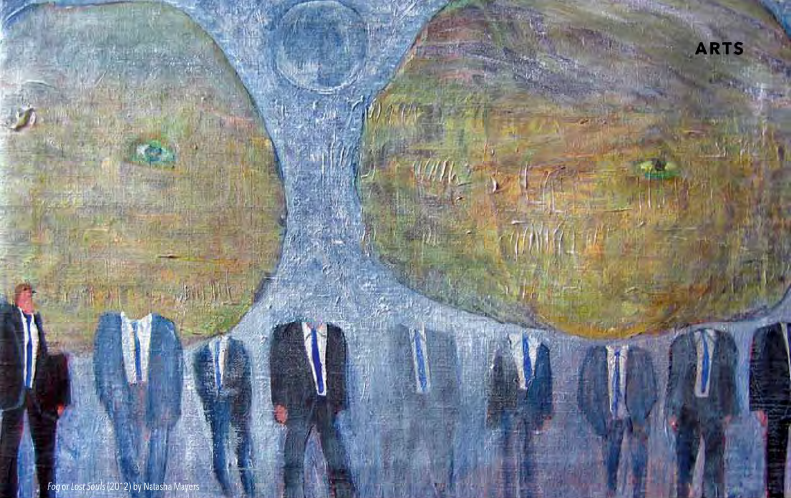
Fog or Lost Souls (2012) by Natasha Mayers