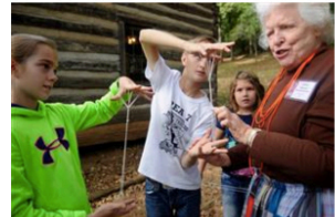
Photos: 37th Tennessee Homecoming brings history to life