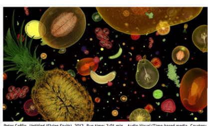
Peter Coffin, Untitled (Flying Fruits) , 2012, Run time: 2:01 min., Audio-Visual/Time-based media. Courtesy of the artist.

Twenty-one artists have rendered their visions of the future for YBCA's "Dissident Futures" exhibit. There's film, video, photography, painting, installation, sculpture, and performance to see, but the piece that left the strongest impression on me was Coffin's Untitled (Flying Fruits) above. Set in its own viewing space, images of fruit float off the screen and toward the viewer. Coffin's work is reminiscent of the beginning of Star Wars , replacing the movement of stars in space with brightly colored orbs of fruit. The result is mesmerizing and humorous. Is form reducible to fruit? Does our existence hold no more meaning than fruit flying through space? I'm amused to think it might be a fruit cocktail version of The Heart Sutra : "Form is emptiness, emptiness itself is form; emptiness is no other than form, form is no other than emptiness..."