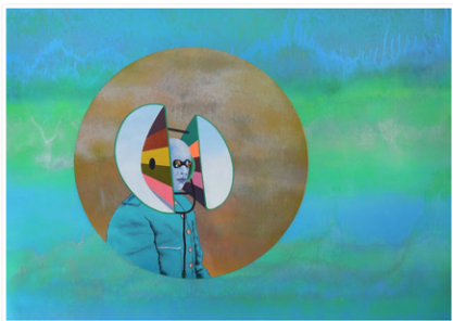
Basim Magdy, An Abstract Reality Leaves You Lonely in The Spotlight , 2010, Spray paint and acrylic on paper.

Twenty-one artists have rendered their visions of the future for YBCA's "Dissident Futures" exhibit. There's film, video, photography, painting, installation, sculpture, and performance to see, but the piece that left the strongest impression on me was Coffin's Untitled (Flying Fruits) above. Set in its own viewing space, images of fruit float off the screen and toward the viewer. Coffin's work is reminiscent of the beginning of Star Wars , replacing the movement of stars in space with brightly colored orbs of fruit. The result is mesmerizing and humorous. Is form reducible to fruit? Does our existence hold no more meaning than fruit flying through space? I'm amused to think it might be a fruit cocktail version of The Heart Sutra : "Form is emptiness, emptiness itself is form; emptiness is no other than form, form is no other than emptiness..."