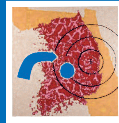
On the cover: Chosen Again Superimposed on Florida (with unknown symbols), 2007; acrylic on canvas, 57 1/2" x 55".