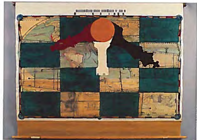
DAN MILLS Beacon, 1998 acrylic and collage on map 51 1/2 x 65 x 2 inches