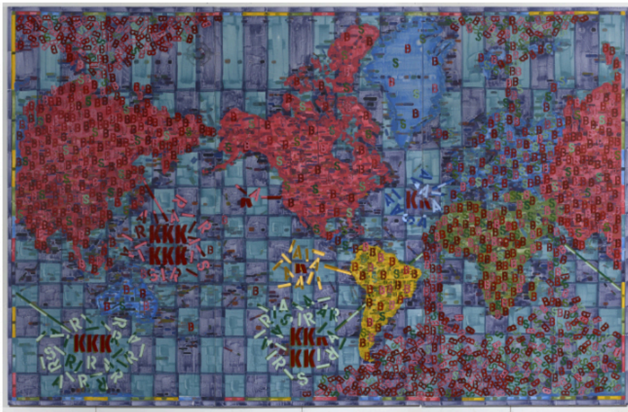
Dan Mills, “Current Wars & Conflicts... (with, by continent, Belligerent and Supporter groups marked with letters, and Asylum Seekers, Internally Displaced, Refugees, Stateless, and Killed marked with a letter for every million)” (2019), acrylic on paper laid down on board, 92 x 144 inches

One of the largest — 92 by 144 inches — and most recent pieces in the show, “Current Wars & Conflicts... (with, by continent, Belligerent and Supporter groups marked with letters, and Asylum Seekers, Internally Displaced, Refugees, Stateless, and Killed marked with a letter for every million),” from 2019, exemplifies Mills’s approach. Using data gleaned from various reports, he presents a world map chock-a-block with stenciled B’s, K’s, S’s, and other letters swarming across the continents, piling up at the bottom of the map and filling up the oceans in between. Each letter represents a million people, a fact that makes this presentation all the more overwhelming.