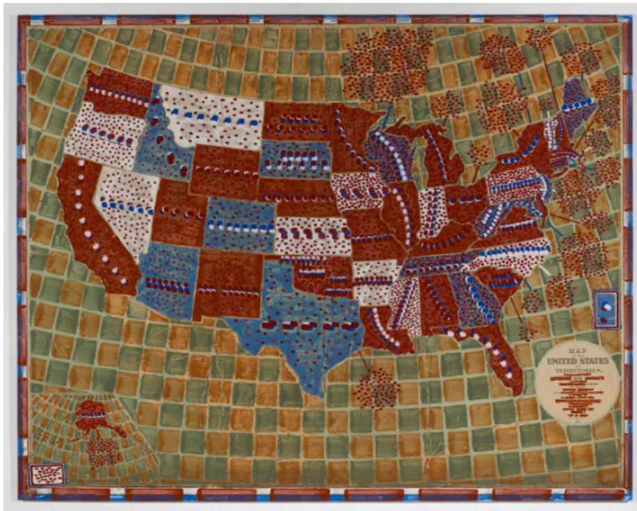
Dan Mills, "What's in a Name? (state names + the number of major geographic features named after indigenous people & words marked with red)" (2018), acrylic on collaged map laid down on board, 65 x 83 inches

ROCKLAND, Maine — A recent fundraising packet from Médecins Sans Frontières/Doctors Without Borders includes a folding map of the world with the headline, "We find out where conditions are the worst — the places where others are not going — and that's where we want to be." On the reverse, the humanitarian organization highlights seven