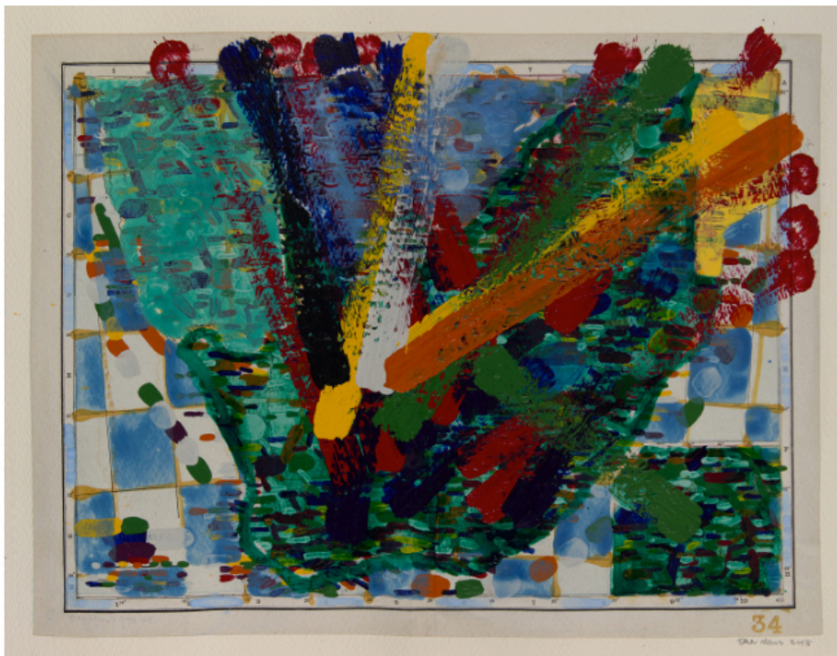
Dan Mills, “Contest – South Africa (with nationalist colors directed towards the countries people migrated from)” (2018), acrylic, watercolor, and ink on map laid down on paper, i. s. 10 ¼ x 13 ¼ inches

Mills’s overlays partake of a variety of aesthetics and art-historical precedents. Take “Contest – South Africa (with nationalist colors directed towards the countries people migrated from),” 2018: From a distance, the expressive strokes of acrylic roughly brushed across the country might recall a Howard Hodgkin painting. The line between painting as painting and painting as political statement is thoroughly and becomingly blurred. By contrast, Mills taps into classic geometric-abstract painting — Kenneth Noland comes to mind — in “Magallanica (everyone wants a piece of it),” 2018. Here, a dramatic, colorful pie chart radiates from the center of Antarctica. It’s a dazzling representation of greed.